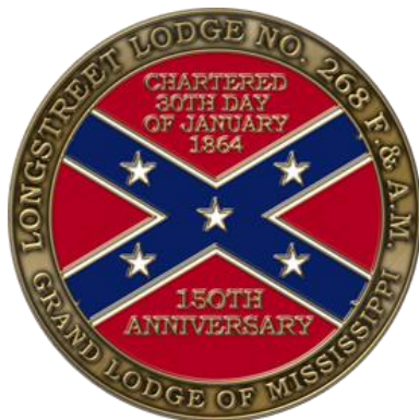
Longstreet Lodge No. 268 Challenge Coin